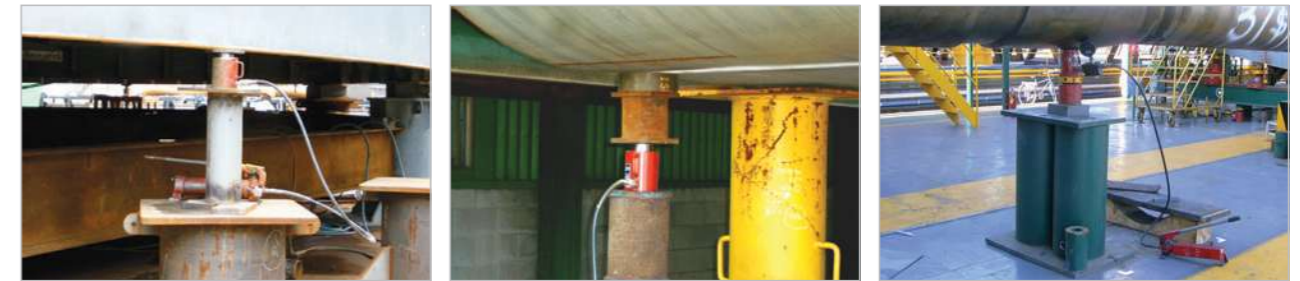
-ECPR series are usually used in ship building companies.